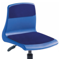
Seat & Back Pad SBP