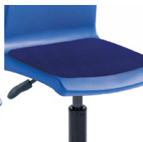
Seat Pad SP