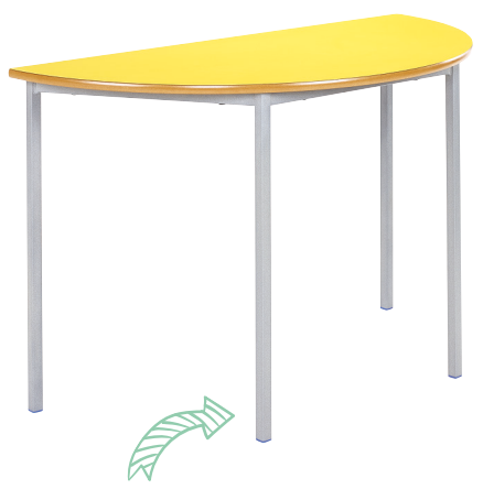
Stordy 25mm square tube frame