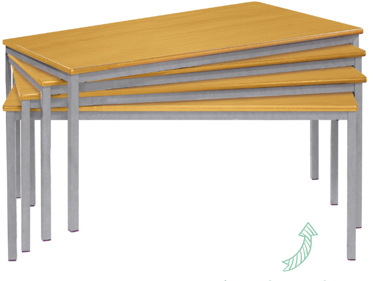
Can be spirally stacked 6 high for ease of storage

The frame and top connection should be checked every six months. The feet should be checked periodically and replaced as and when required. Clean periodically with a non-abrasive cleaner and a warm damp cloth.