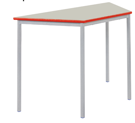
Traditional Fully Welded tables with quality finish